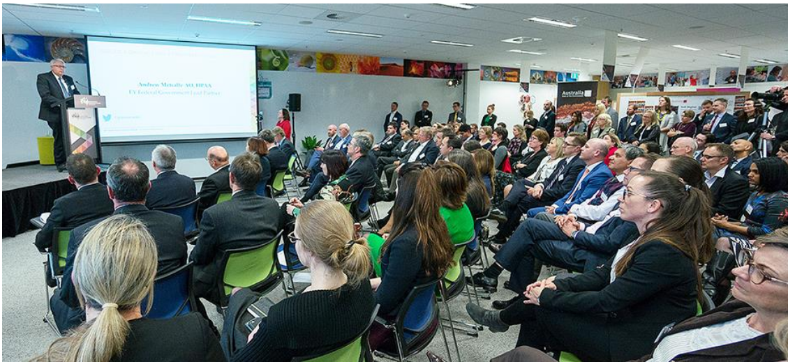
(above) the Award Ceremony at the DHS Design Hub