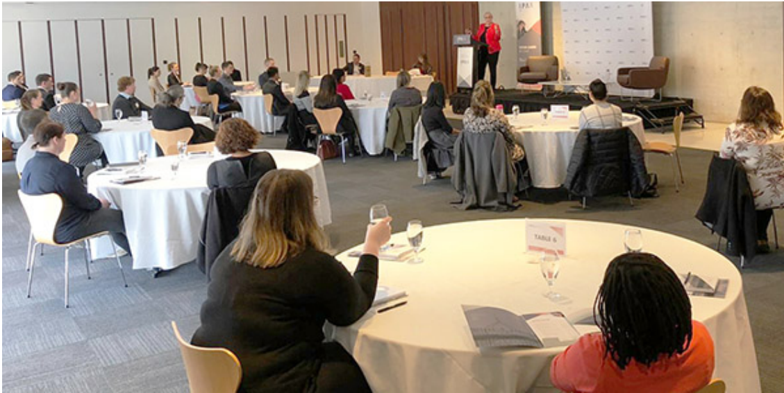
Launch of the 2020 Future Leaders Program at the National Portrait Gallery.